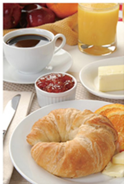
2. continental breakfast