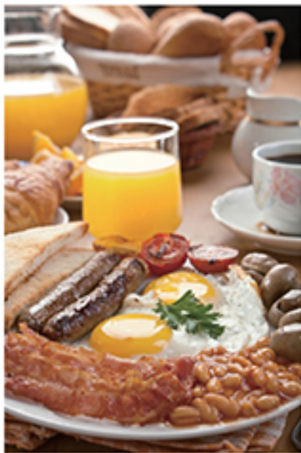
1. English breakfast